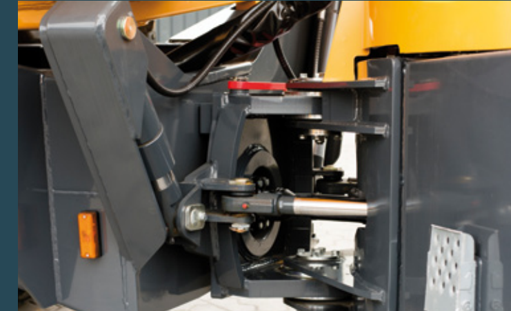
Articulated swivel joint with stabilization cylinder.