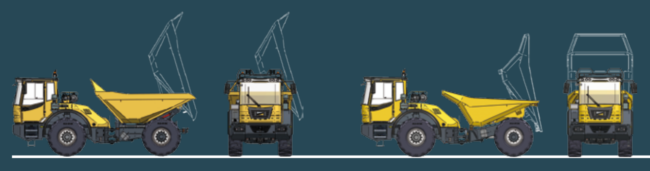
C815s Swivel-tip dumper