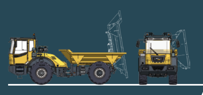
C815s Three-way dumper